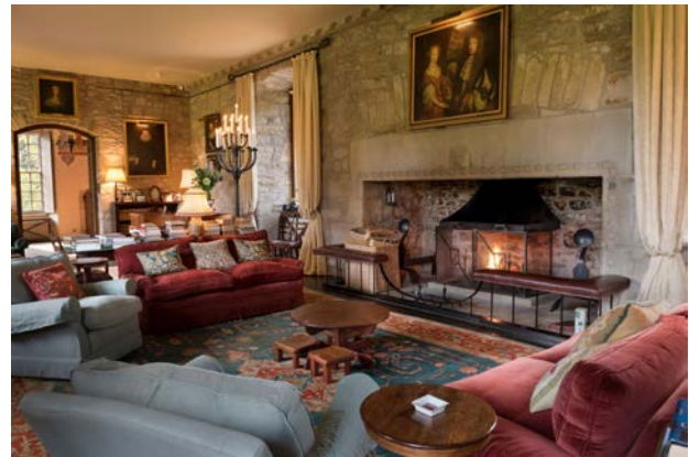
created from one of the 15th century undercrofts and a display of Kerr memorabilia in another.

Jedworth Forest and builds a tower at Ferniehirst below Lintalee in Glen Douglas among the great oak trees above Jed Water.