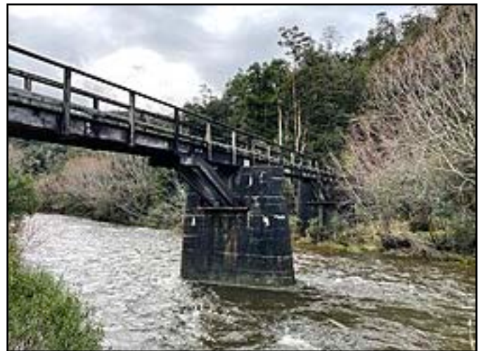
Former Railway Bridge over Hope River near Kawatiri, now adapted to use as part of a short walking track.

Just to be different, there are 3 Hope Rivers in New Zealand and all 3 are in the South Island and they all form part of the one river system and yet retain their own identities.