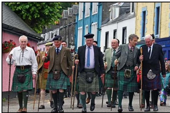
A group of Clan Chiefs

The defining aspect of a Scottish clan is the Clan Chief. In Gaelic tanistry, these chiefs were elected by family heads in full assembly. However, with the encroaching French-Norman invaders in 12th century, the selection of a “chief” became more complicated. In the 21st century, becoming chief has become a much more complex process.