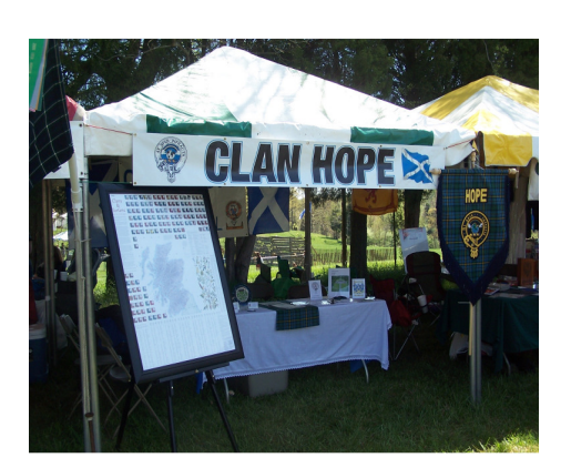
Clan Hope Tent At Loch Norman Games

February 27<sup>th</sup> & 28<sup>th</sup> 2010. Clan Hope sponsored and manned a tent at the 46<sup>th</sup> Clan Gathering and Highland Games, Phoenix Arizona.